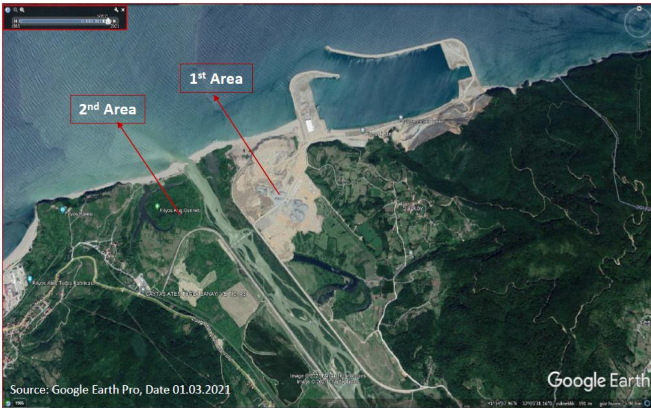
Figure 4-1: The two possible landfall sites in Filyos area.

Several options to the landfall siting in Filyos were taken into consideration. In particular, two areas were considered as appropriate to the landfall ( Figure 4-1 Figure 4-4 ).