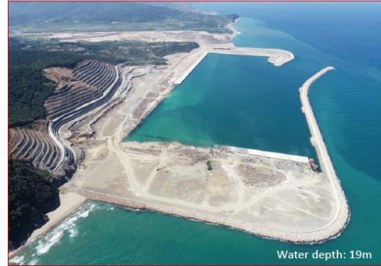
Figure 4-4: Port Surface Area Needed to Support the Project

In addition, due to the limited presence of privately owned land, there will be limited or no need for an expropriation process within the scope of the Project. In addition, the existing environmental plan and master development plan are also suitable for the planned facilities. These issues will also bring with them the minimization of cost and time loss that will arise with expropriation, environmental and zoning plan studies.